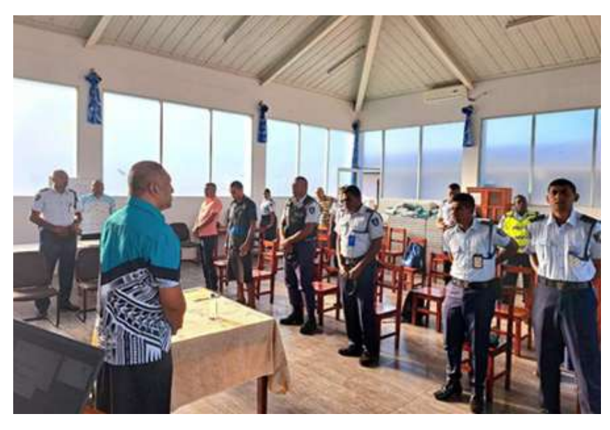
MSP organized the training in partnership with the Fiji Police Force Psychology Unit with the support of UNDP and MFAT.

The week-long mission to Rotuma, Kadavu, Rakiraki and the Northern Division focused on raising awareness to police officers and their families about the work of the Psychology Unit of the Force. The team targeted issues around the family that police work affects as well as coping strategies for officers to alleviate them. These broad topics transitioned into deeper group discussions focused on the family.